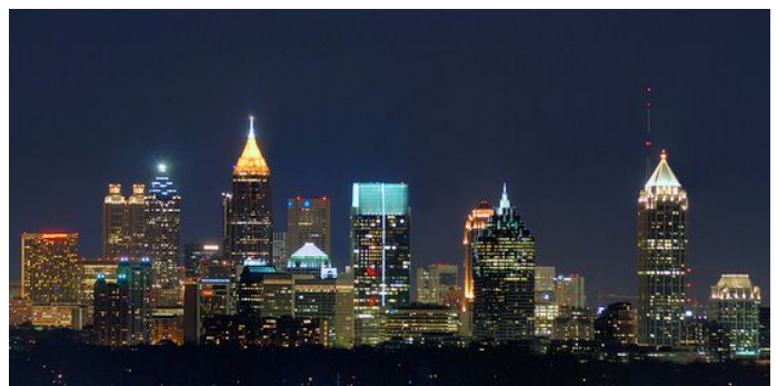
The 54th AACE Annual Meeting will be held at the Marriott Marquis hotel in Atlanta on June 27-30, 2010., where there's plenty of night life to enjoy.