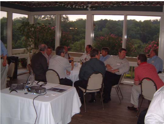
Members, guests, and visitors enjoy conversation prior to the September Atlanta Area Section meeting at the Cross Creek Café.