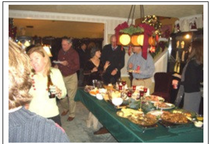
If you left hungry, it was your fault.