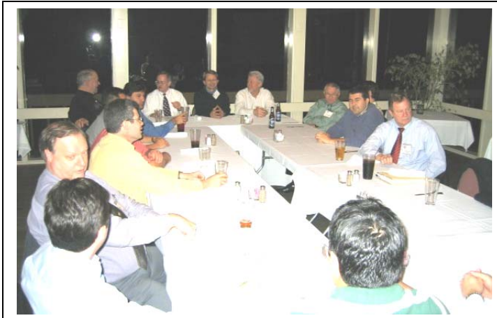
Atlanta Section members gather at for the beginning of the February membership meeting.